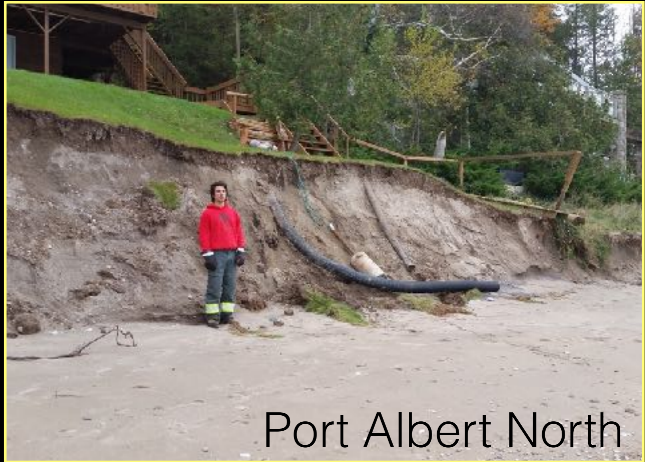
Port Albert North