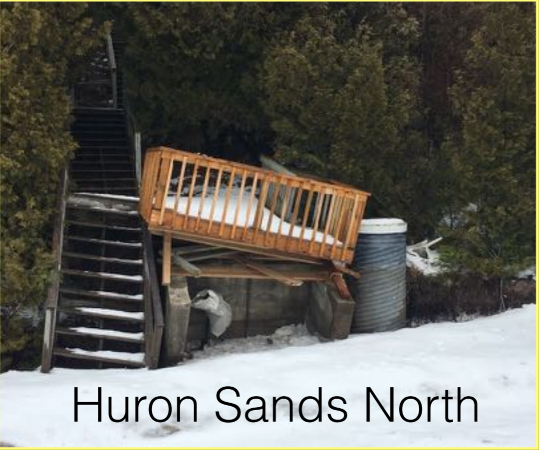
Huron Sands North