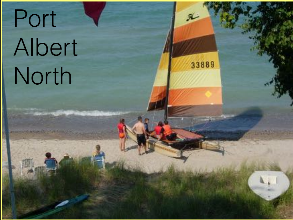
Port Albert North